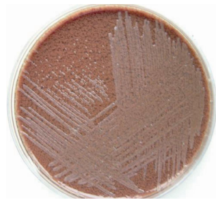
Figure 1. Colony morphology of F.lindanitolerans CN-1 strain. The cells were cultured on Chocolate agar for 48 h (see the description in text).

Columbia blood agar and Chocolate agar respectively. One isolate was obtained on chocolate agar at 37 °C and 5% CO 2 . X factor (Hemin) was required for growth. The isolate did not present hemolytic on blood agar. The colony morphology initially had a translucent or transparent appearance and after 48 h, they became cream–yellow in color and had a diameter of 1.5 mm (Figure 1).