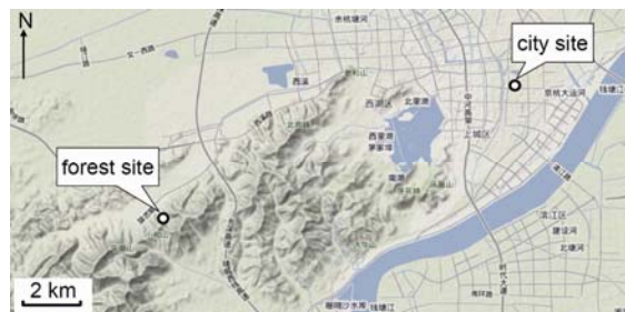
Figure 1. Location of the experimental sites. Wuchao Mountain Forest is located in the suburban district of Hangzhou and is about 15 km from the urban experimental site, which is located in the downtown area.

Mountain Forest in Hangzhou (Zhejiang, China) from 26 to 28 September 2010. The forest covers an area of about 330 000 m 2 , and the predominant species are Ormosia hosiei , Diospyros glaucifolia , Chamaecyparis pisifera , Zelkova schneideriana , Machilus pauhoi , Cladrastis platycarpa , Manglietia yuyuanensis , Cinnamomum camphora , Ormosia hosiei , Magnolia officinalis subsp. biloba , and Nyssa sinensis . An urban area was used for comparison. The two experimental sites are shown on the map in Figure 1. Hereinafter, the two sites are referred to as the forest area and the city area.