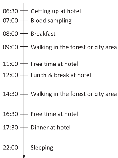
Figure 2. The experimental protocol for subjects exposed to the forest or urban environment.

To control for environmental conditions, the same single rooms were prepared as lodgings for each subject, and the same meals were offered during the experiments. The subjects were randomly divided into two groups consisting of 10 people each. One group was sent to the forest site, the other to the city site. On the morning of 26 September, each group was taken to its experimental site. The subjects then walked along a predetermined course in each area at an unhurried pace for about 1.5 h, with a 10-minute rest during the walk. In the afternoon, after taking lunch in the resting room, the subjects walked another predetermined course in each area at an unhurried pace for about 1.5 h, with a 10-minute rest during the walk. The subjects were allowed to do as they wished in the hotel, though avoiding strenuous exercise and any stimulating activities in their hours of relaxation before sleeping. The subjects were kept at each experimental site for two days. In the morning before breakfast on 28 September, both two groups were taken to our hospital (it took 30-40 min by car for each group to return from the experimental sites), and blood was sampled for tests in the clinical laboratory by technicians.