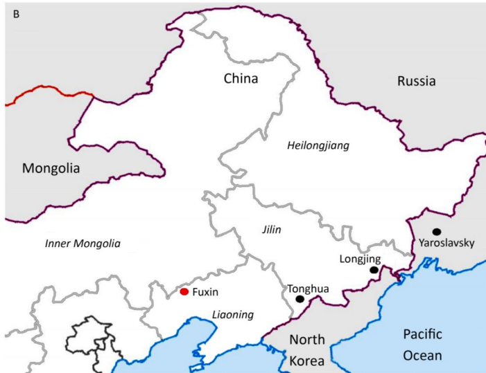
Figure 1. (A) Maximum likelihood of the lyssavirus-rooted phylogenetic tree based on the complete N sequences. Irkut virus FX17 is marked using black triangle on the tree. Bootstrap values are presented as percentages for key nodes, and branch lengths are indicated using a scale bar. EBLV-1: European bat lyssavirus-1; DUVV: Duvenhage virus; IRKV: Irkut virus; ARAV: Aravan virus; BBLV: Bokeloh bat lyssavirus; KHUV: Khujand virus; EBLV-2: European bat lyssavirus-2; ABLV: Australian bat lyssavirus; RABV: rabies virus; WCBV: West Caucasian bat virus; SHIBV: Shimoni bat virus; MOKV: Mokola virus; LBV: Lagos bat virus; IKOV: Ikoma lyssavirus; GBLV: Gannoruwa bat lyssavirus; and LLEBV: Lleida bat lyssavirus. (B) Fuxin city and surrounding regions in Russia and China. Black dots indicate the location of IRKV-associated human rabies cases within China and Russia. The red dot identifies where Irkut virus FX17 was detected.